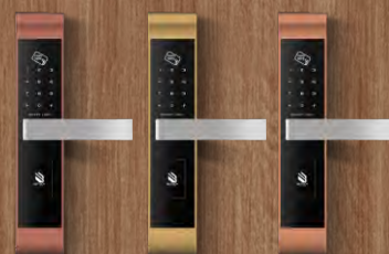
Red Bronze PVD Gold Rose Gold

Unlock your life with smart solution Leave your home security to Be-Tech